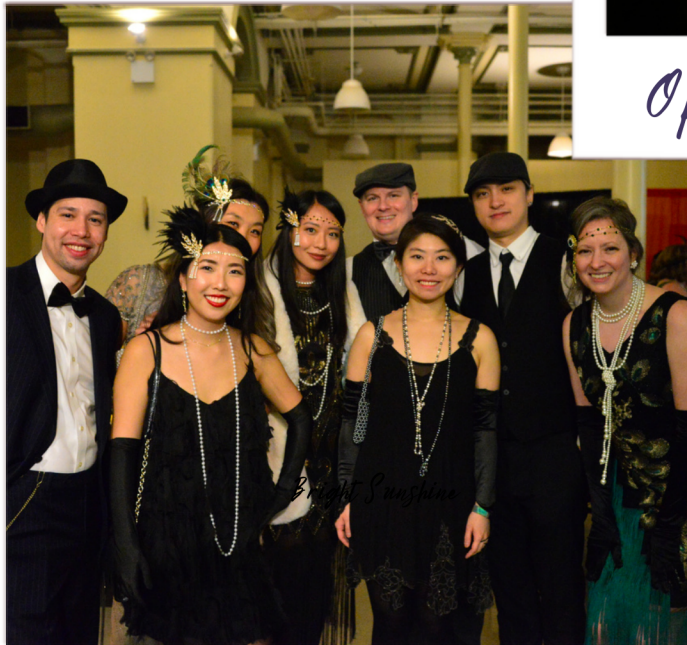
Roaring 20s Dinner Dance